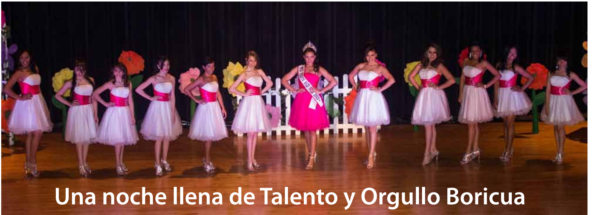
Una noche llena de Talento y Orgullo Boricua